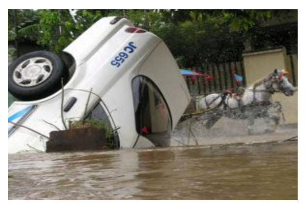
Shocking picture of Jakarta flood last year. The taxi car is upside down

thunder strikes often. After two hours, the rain isn't stopped, but in low intensity. In South Jakarta near 7D Protectorate, the river going up and made a flood of 10 cm, in other places may be various between 5 to 15 cm. In State of Southall, the rain is in low intensity but lasted long. Same as Southall, State of Dalnik is having the rain in low intensity